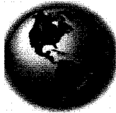
Fig. Green Earth

Green computing is the study and practice of using computing resources efficiently. The primary objective of such a program is to account an expanded spectrum of values and criteria for measuring organizational (and societal) success. The goals are similar to green chemistry; reduce the use of hazardous materials, maximize energy efficiency during the product's lifetime, and promote recyclability or biodegradability of defunct products and factory waste